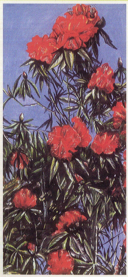
Rhododendron arboreum (Laliguras), the national flower of Nepal.