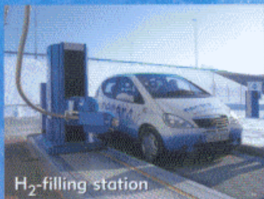
H 2 -filling station

Fuel Cell Technology and Applications Part 2